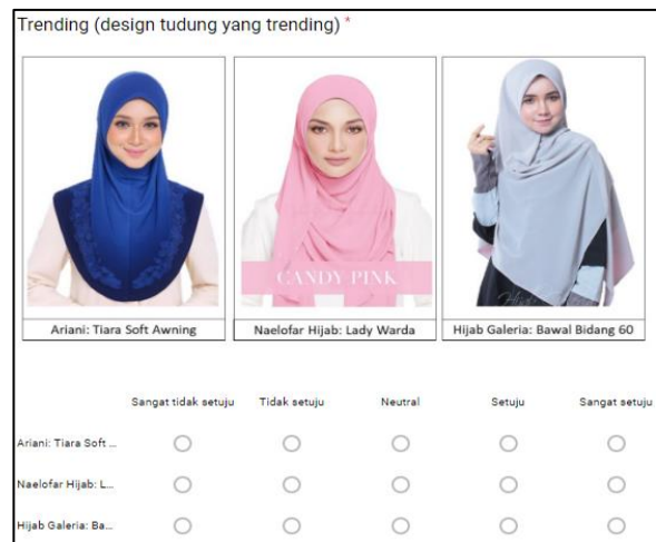
Figure 2: Part of the Kansei Questionnaire form

age, gender, and race. The questionnaire part contains the rating questionnaire in which a respondent was asked to rates the three designs based on the ten Kansei words. A five points Likert scale was used in this study which are 'strongly disagree', 'disagree', 'neutral', 'agree', and 'strongly agree'. Figure 2 illustrates the part of the Kansei Questionnaire form. The thanking part of the questionnaire was simply to address the thank you note to the respondents for their support in participating in the study. The language used in the Kansei Questionnaire form was Malay language so that it may minimize the confusion among the respondents regarding the meaning of the Kansei words.