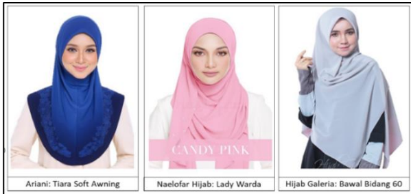
Figure 1: The three selected tudung designs: Left: Ariani (Ariani Online, 2018); Middle: Naelofar (Naelofarhijab, 2018); and Right: Galeria (Hijabgaleria, 2018)

desire design criteria of the tudungs in the current market. As the results, three tudungs were selected. They are: (i) Ariani - Tiara Soft Awning (Ariani Online, 2018); (ii) Naelofar Hijab - Lady Warda (Naelofarhijab, 2018); and (iii) Hijab Galeria - Bawal Bidang 60 (Hijabgaleria, 2018). To ease the writing of this study, the three selected design were named as (i) Ariani; (ii) Naelofar; and (iii) Galeria. Figure 1 illustrates the three tudung designs selected.